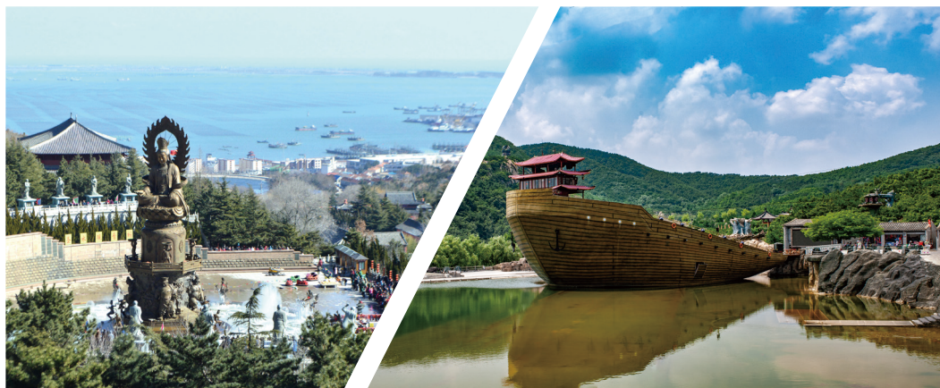
Addresses and telephone numbers of tourist attractions in Weihai