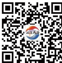
Official WeChat Account of Rule of Law in Weihai