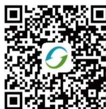
Official APP of Weihai Public Transport Group