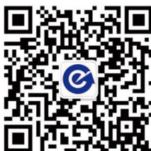
Official WeChat Account of Weihai Jiaoyun Group Public Transport Co., Ltd.

Call Weihai Jiaoyun Group Public Transport Co., Ltd. at 0631-6079607 or scan the following QR code to follow the official WeChat account of Weihai Jiaoyun Group Public Transport Co., Ltd. to check the routes of buses numbered 200 and above.