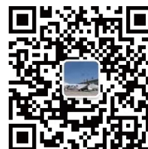
Official WeChat Account of Weihai International Airport

For details, follow the official WeChat account of Weihai International Airport or scan the following QR code.