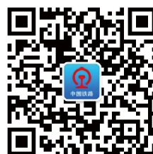
Official WeChat Account of Railway 12306