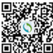
Official WeChat Account of Weihai Public Transport Group

Visit the website: https://weihai.8684.cn , call Weihai Public Transport Group at 0631-5230950 or scan the following QR codes to check the routes of buses numbered 199 and below