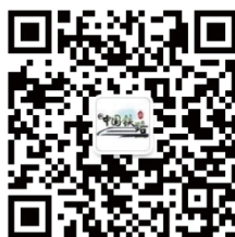
Official WeChat Account of China Railway